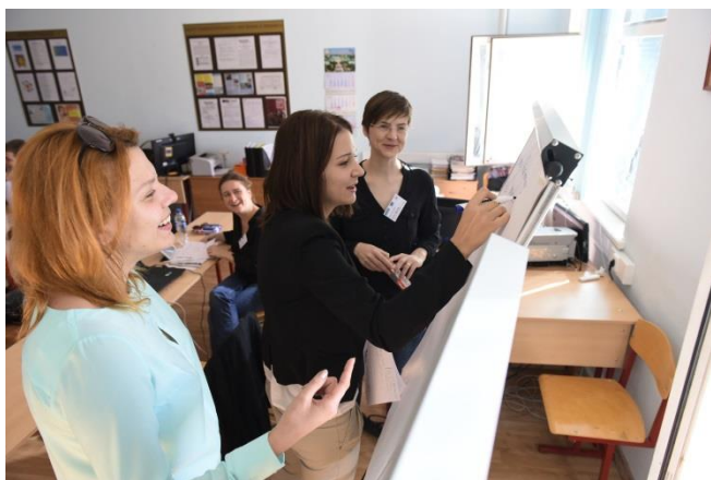
Second VALERU VNIL training in Rostov-on-Don, September 2015

Following the methodological seminar, the second VALERU VNIL expert training started on the 30 th of September at Don State Technical University. The training providers were DUK , DUW and UoC , while the training participants came from different backgrounds, such as the medicine sector, business and economics, robotics and engineering, language teaching, etc.