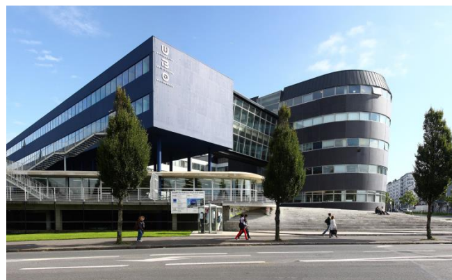
The pictures shows the faculty for humanities and social science at University of Western Brittany (Université de Bretagne occidentale), where the VALERU workshop will take place.

The second part of the workshop will give an insight into the VNIL jury model at UBO with speeches of jury members from a different background (sciences, human resources management, management and humanities).