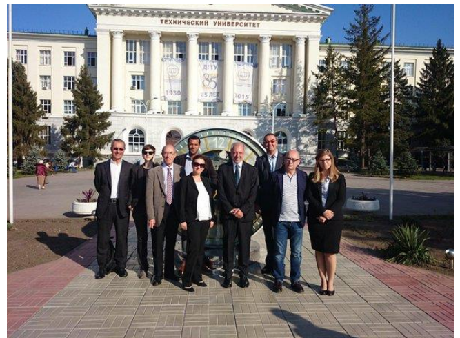
VALERU project team in Rostov-on-Don, September 2015

The VALERU project partners met on the 29 th of September 2015 at Don State Technical University for the seminar “Validation Procedures – A Methodological Seminar”, hosted by Bologna Club (BC). The main purpose of the seminar was to disseminate the VALERU project and the VNIL expert training strategy, to officially launch and introduce the VALERU platform and to discuss VNIL procedures and ways of implementation. The Seminar was mostly held in Russian